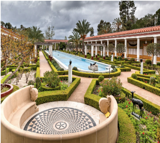
The Getty Villa.

Today the Pacific Palisades is known for its many midcentury landmark homes and for the celebrity estates that adorn the coastline. The beautiful Will Rogers State Beach that stretches along the length of the Palisades attracts beachgoers looking to escape the crowds of Santa Monica and Venice, and the Pacific Coast Highway is a common recreational drive for those who want to take in the gorgeous coastline and breathe the ocean air.