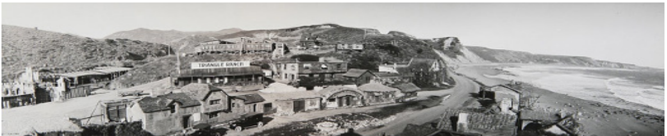
Inceville, 1919