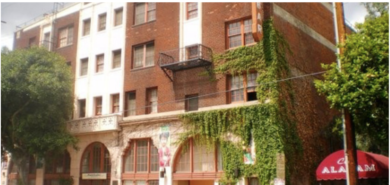
The Dunbar Hotel today.