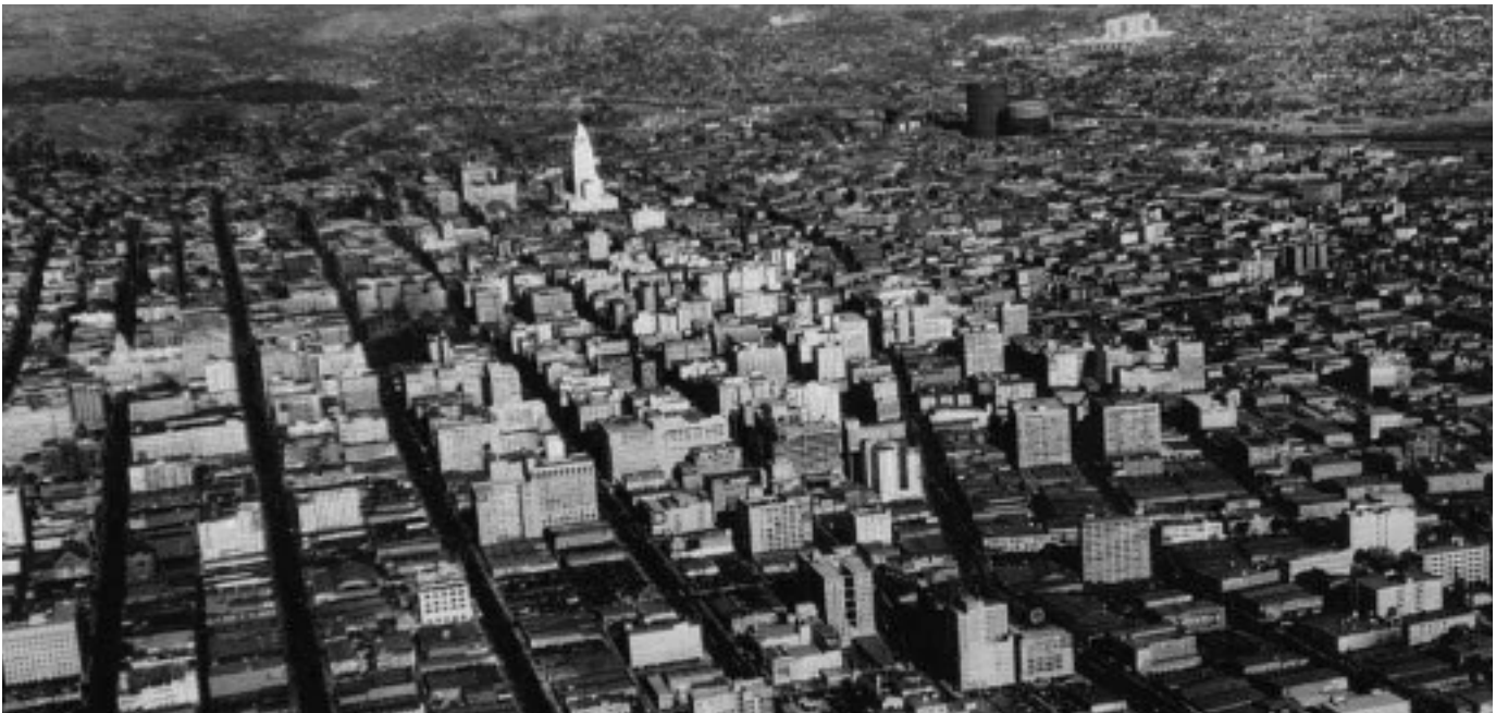
Aerial View of Downtown Los Angeles, 1935.

Northwest from the Civic Center across the 101 Freeway lies L.A.’s Chinatown. Today’s Chinatown is actually a relocation of the original; Old Chinatown was centered on what is today Alameda Street and Cesar Chavez Avenue. Established in 1880 in response to a growing population of Chinese immigrants hired to work for the Central Pacific Railroad, Old Chinatown reached its peak in the 1910s, consisting of fifteen streets and alleyways and over 200 buildings, including an opera theatre, three temples, a newspaper and a telephone exchange.