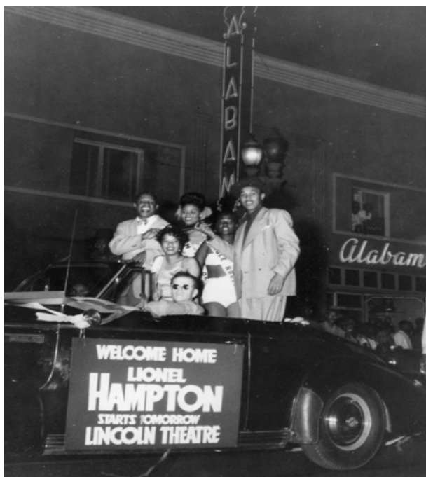
Lionel Hampton in front of Club Alabam, ca. 1953.