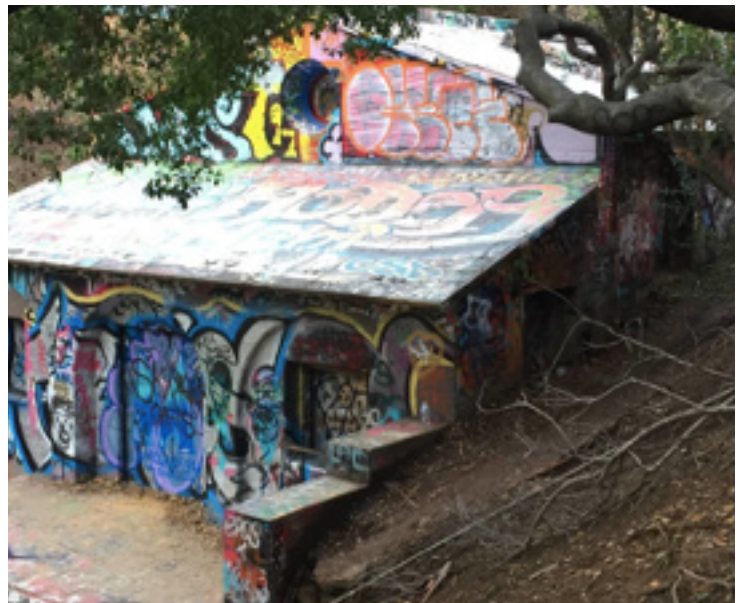
The Murphy Ranch generator building today.