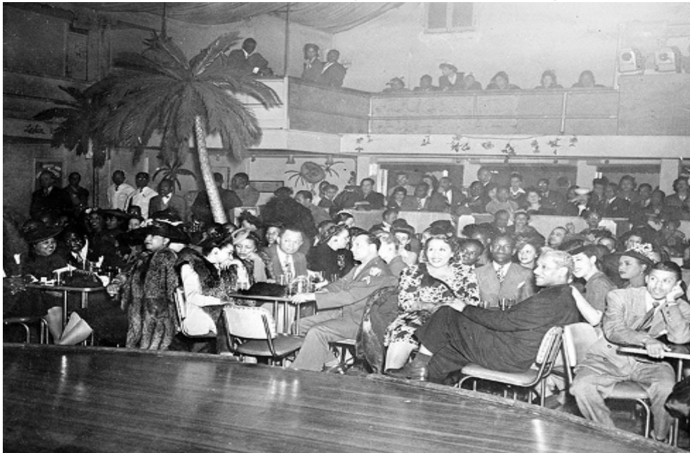
An audience watches a performance at Club Alabam.