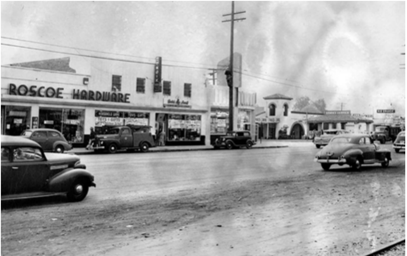
Roscoe Hardware in Sun Valley, 1949.

Sun Valley is a neighborhood in Los Angeles city proper, in the northeast San Fernando Valley, bordered by Burbank, North Hollywood and Valley Glen to the south, Shadow Hills, Pacoima, and Lake View Terrace to the north, and Panorama City to the west. The 91352 ZIP code has a population of nearly 48,000 within 11.67 square miles. The population is majority white with a sizable Latinx minority. The median home value is about $338,000 with a median income of just below $49,000. The population has a significantly larger-than-average number of single parents, and the population of children under 18 is large compared to the national average. Part of Sun Valley is also located in the 91605 ZIP code, and the total population of the neighborhood is about 56,000.