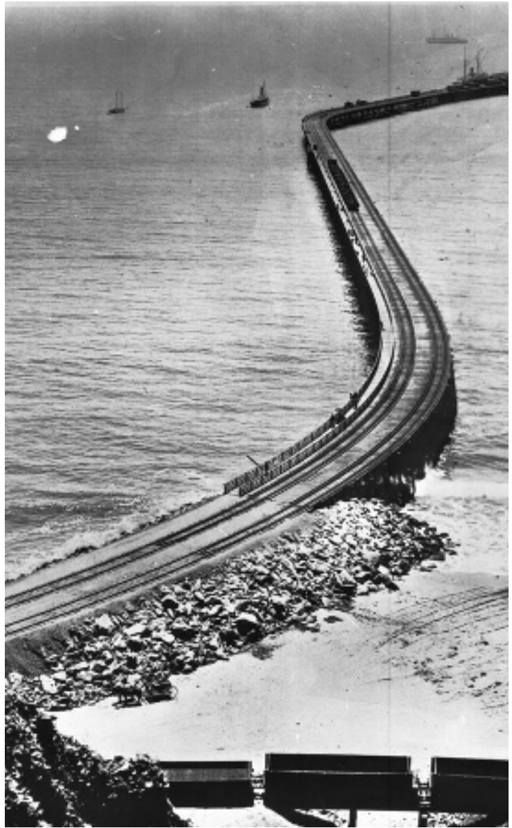
The Long Wharf, 1895.

In the late 1940s, Paramahansa Yogananda’s Self-Realization Fellowship acquired ten acres of land connected to Sunset Boulevard and dedicated the Self-Realization Fellowship Lake Shrine, which today features the Mahatma Gandhi World Peace Memorial, containing the only portion of Gandhi’s ashes outside of India. George Harrison, Herb Jeffries, and Tom Petty all had their funeral services at the shrine, which is considered by the Fellowship to be a holy place for all religions and faiths.