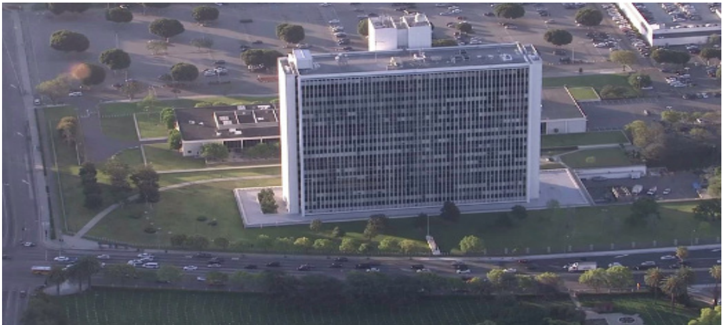
The Wilshire Federal Building.