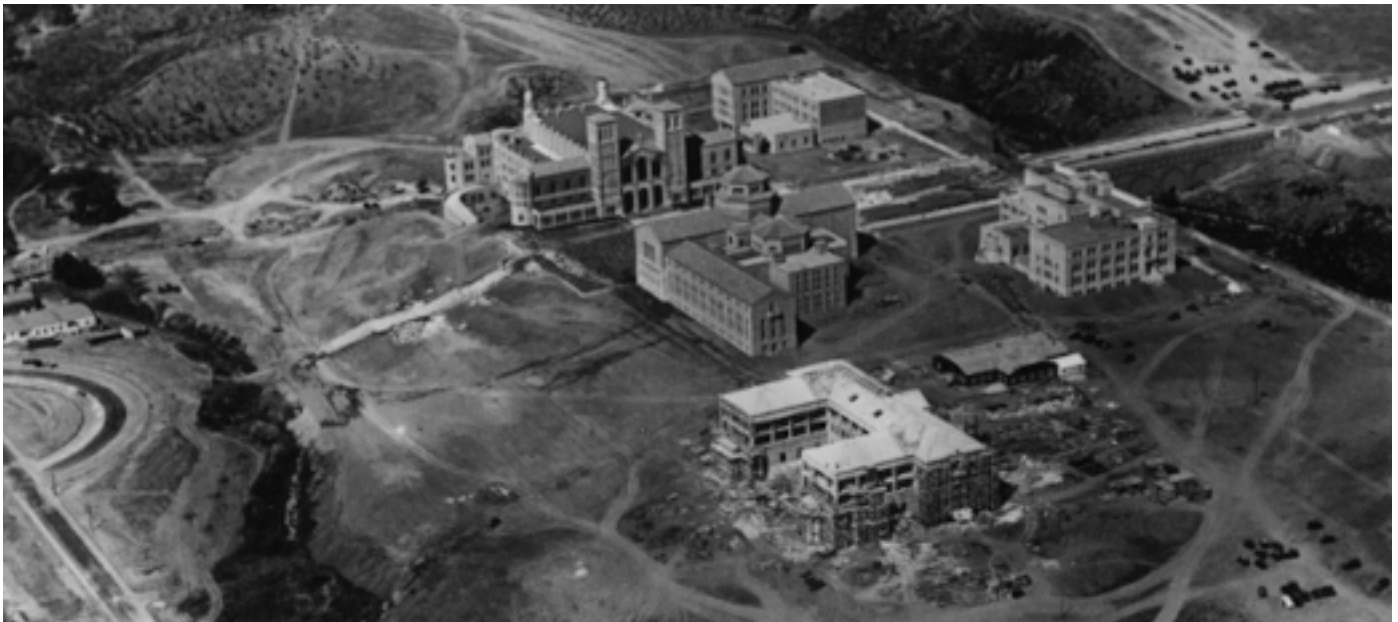
The first wave of construction of the UCLA Westwood campus, 1929.

Meanwhile, around campus the construction of the I-405 and urban developments along Wilshire Boulevard brought even more activity to Westwood Village. In the 1960s through the 1980s the nightlife industry largely overtook community retail stores and entertainment venues such as movie theatres continued to spring up around the area. The dominance of the theatres led to massive crowds in the Village, sometimes to the detriment of businesses. A series of events in the 80s changed Westwood's reputation from a safe and popular retail and entertainment center. In July 1984, Daniel Lee Young drove into a crowded sidewalk, killing three pedestrians and injuring 39 more. In December of 1987, 1,000 people were involved in a large fight midway through the premiere of Eddie Murphy's Raw . And in January of 1988, bystander Karen Toshima was shot in the head and killed by a member of a South Central street gang. This event triggered an overnight decline in the Village. For businesses that had been struggling since the opening of a number of