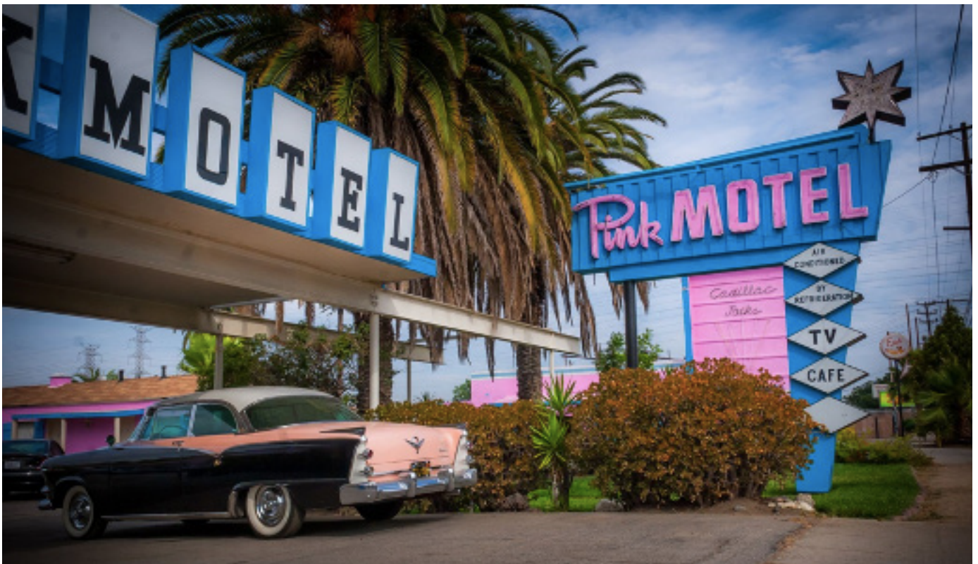
The Pink Motel.

Despite its difficulties, Sun Valley boasts a number of attractive features and landmarks. The Pink Motel, a retro 50s-style motel built in 1946, is an eye-catching roadside attraction off San Fernando Road. The motel has been featured in a number of movies and TV shows, including Netflix’s GLOW , Dexter , Drive , The O.C. , and Westworld . In La Tuna Canyon, the Theodore Payne Foundation for Wild Flowers and Native Plants serves as a nursery and gallery that features and fosters education around California native plant life. For those interested in architecture, the Stonehurst Recreation Center Building is an example of stonemason Daniel Lawrence Montelongo’s 1920s construction on what is now known as the Stonehurst Historic Preservation Overlay Zone—a neighborhood of 92 homes built out of local river rock. The Community building was saved from demolition when local residents petitioned to have it designated a historical landmark in 1977. And for hikers, the 2.25 mile La Tuna Canyon Trail ascends 975 feet and offers beautiful views of the San Fernando Valley and the San Gabriel Mountains.