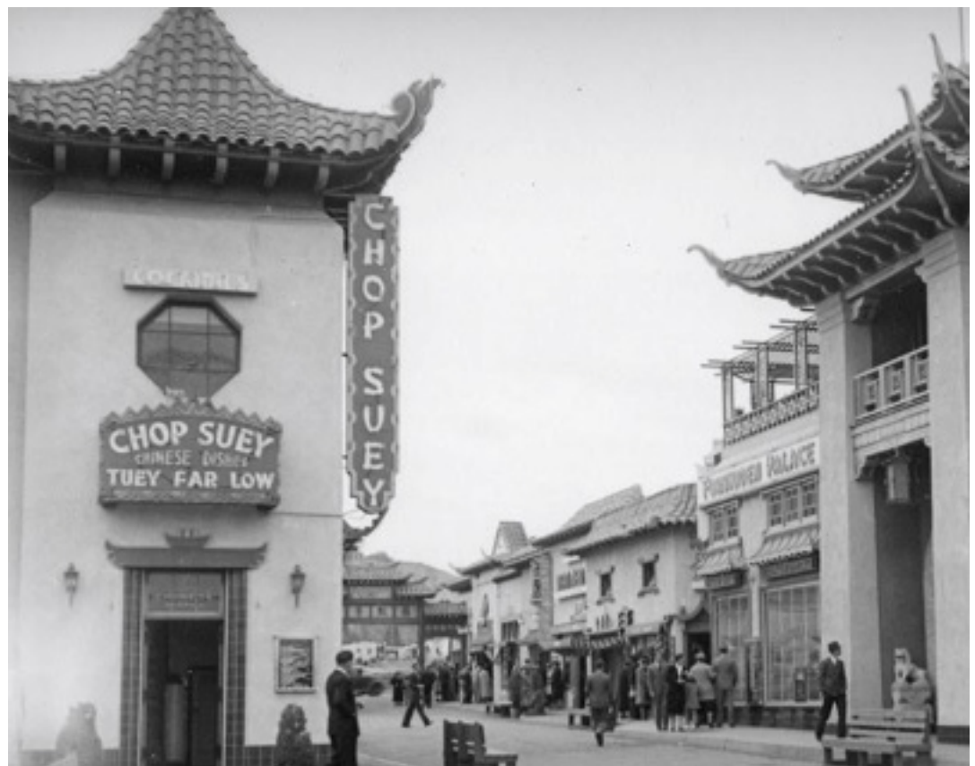
New Chinatown, 1938. The West Gate (Hill Street entrance) can be seen in the distance.