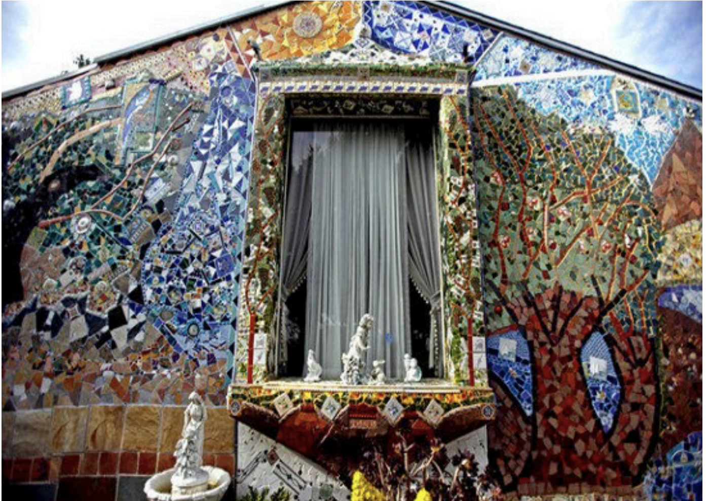
The Farnam House.

Allegedly the house has been quite unpopular with neighbors, but that hasn't changed the fact that the house attracts amateur appreciators and fellow architects to appreciate the facade as a fusion of a modern art piece and functional architecture.